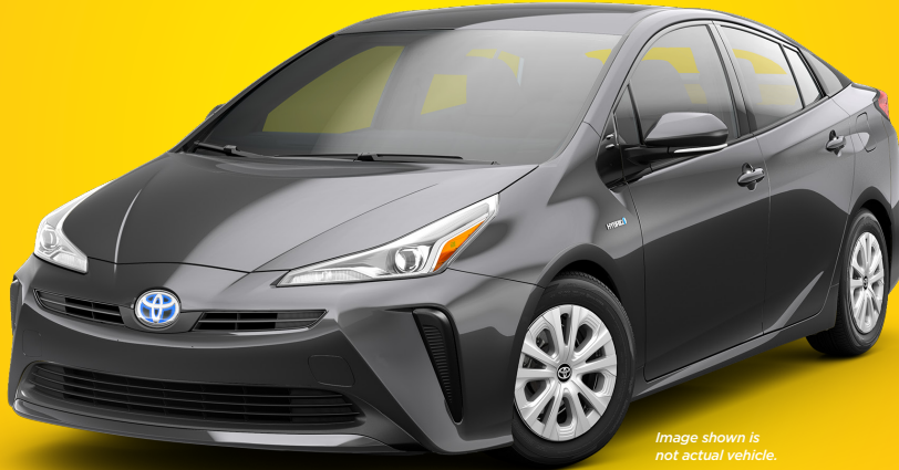
Image shown is not actual vehicle.